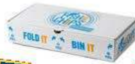
1 Medium Fold It, Bin It Corrugated Box Quantity: 100 Size: 280x155x55mm FTFHCMTF