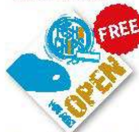
Open / Closed Door Sign Size: 175x175mm