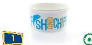
1 Hook & Fish 4oz Card Pots Quantity: 1000 Size: 75(dia)x40mm FC4CCHF