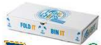
1 Large Fold It, Bin It Corrugated Box Quantity: 100 Size: 315x155x55mm FTFHCCLTF