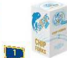
1 Forks in Dispenser Quantity: approx.1000 forks Box size: 117x198x90mm DCHFWD

"I like the continuity of the branding and how it all links together to look professional"