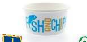
1 Hook & Fish 7oz Card Pots Quantity: 1000 Size: 90(dia)x50mm FC7CHF