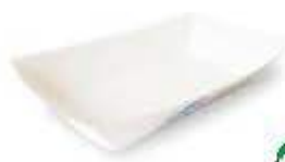
Card Tray Medium Quantity: 500 Size: 145x80x40mm FTHFCT145