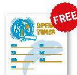
Opening Times Door Sign Size: 175x175mm