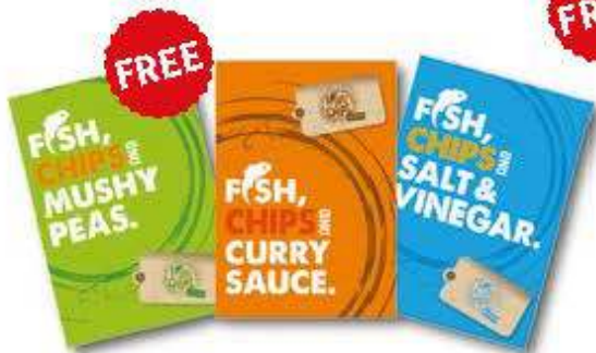
A3 Size Posters 3 Designs