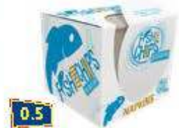
0.5 Napkins in Dispenser Box size: 150x165 x 65mm Serviette size: 160x160mm (folded) Quantity: 250 WRHFNAP