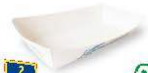
2 Card Tray Large Quantity: 250 Size: 190x85x45mm FTCSHF