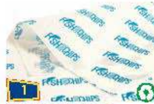
1 Greaseproof Paper Quantity: 1000 sheets Size: 300x200 mm WRHF32