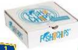
1 Chip Box Quantity: 100 Size: 150x150x55mm FTFHCCT