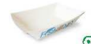
Card Tray Small Quantity: 500 Size: 100x75x40mm FTHFCT100