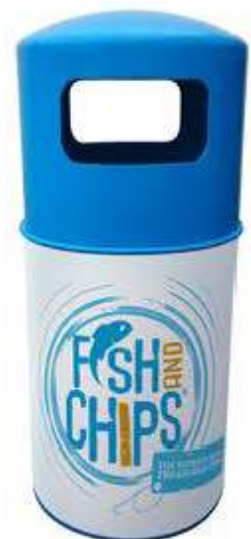
Hook & Fish 90 litre Bin Size: 1000x430mm Includes plastic liner Made to order – estimated lead time of 2 weeks